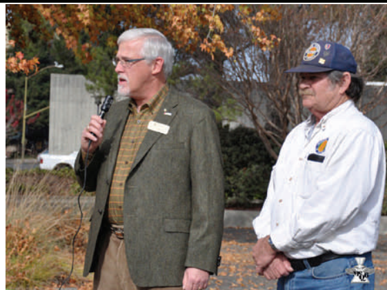
Santa Rosa Mayor Scott Bartley welcomes the assembly to the flag raising ceremony at City Hall.