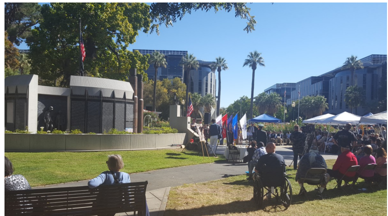
The memorial and crowd during the ceremonies