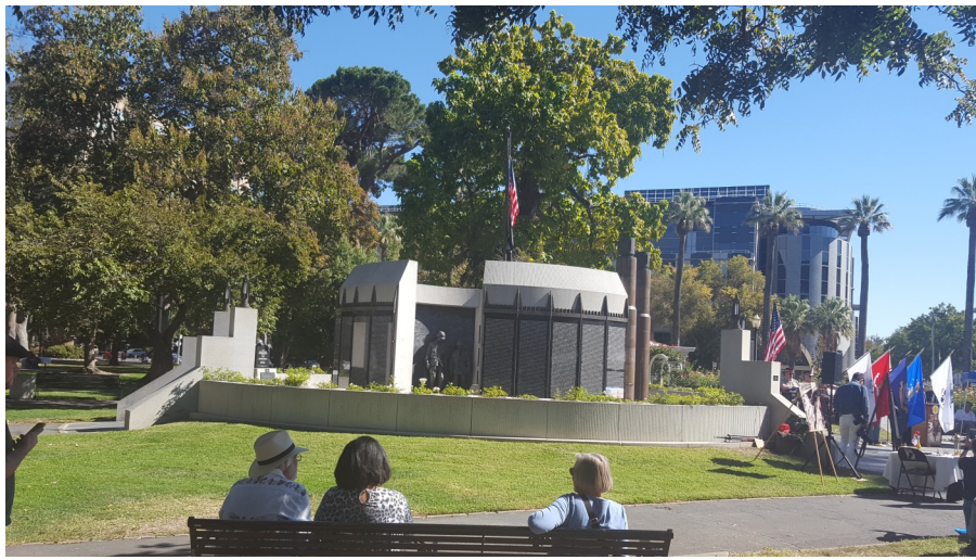
The Memorial with flags before ceremony