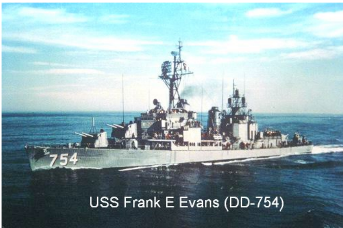
USS Frank E Evans (DD-754)

In a ceremony on March 29, 2015, the names of 32 veterans were added to the California Vietnam Veterans Memorial Wall. They will be forever etched alongside the more than 5000 other Californians already enshrined there who died in the Vietnam War. The ceremony was hosted by the California Department of Veterans Affairs (CalVet), the Vietnam Veterans Memorial Honor Committee, and the Vietnam Veterans of America Chapter 500 of Sacramento Valley.