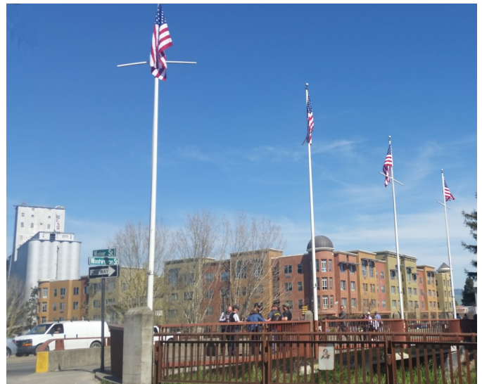
New flags on E. Washington Street Bridge in Petaluma

As an ageing demographic, Vietnam veterans are increasingly reminded of past events. For many veterans of our generation there will be many 50th anniversaries we will observe over the next few years. We must not forget those who gave their lives in that struggle. Their sacrifices will be remembered as they remain in our hearts forever young.